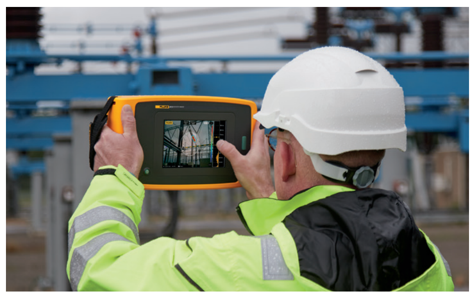
Image taken of the ii910 Precision Acoustic Imager detecting partial discharge in a high voltage application.